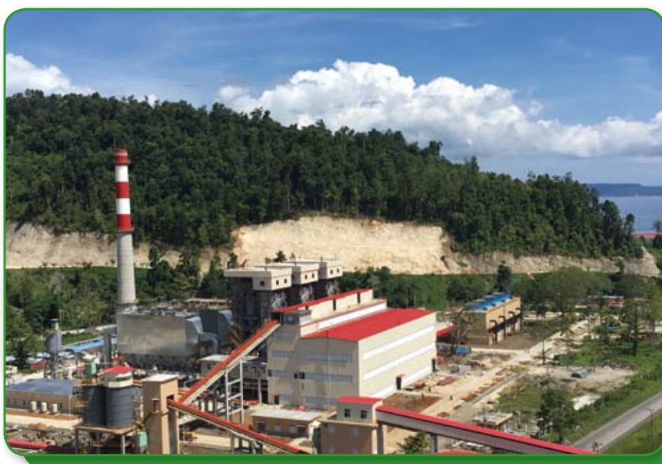
Self-owned power plant in West Papua, Indonesia constructed by the Company

The Group’s principal activities consist of three major segments, namely energy-saving, environmental-protection and new building materials. Energy-saving business mainly includes residual heat power generation in cement industry, residual heat utilization in steel, metallurgy and ferrosilicon industry, construction of self-owned coal-fired power plants and mills equipment for large-scale industrial mining enterprises. Environmental protection business mainly includes (i) collaborative treatment of municipal waste by cement kilns; (ii) collaborative treatment of solid and hazardous waste by cement kilns; and (iii) grate furnace power generation. In addition, with the advanced technologies introduced from Europe, the Company has set up two production bases in Wuhu and Bozhou, Anhui Province for the production and sale of new energy-saving wall materials such as fiber cement boards.