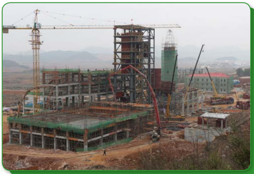
Yanshan grate furnace power generation project under construction

During the Reporting Period, 7 projects of grate furnace power generation were under construction, and 1 project has been completed and was put into operation, which had processed 93,000 tonnes of garbage with an on-grid power generation of 21,300,000 kWh. As at the end of the Reporting Period, the annual treatment capacity of the completed grate furnace power generation projects is approximately 100,000 tonnes, and the annual treatment capacity of contracted projects under construction and to be constructed is approximately 1,460,000 tonnes.