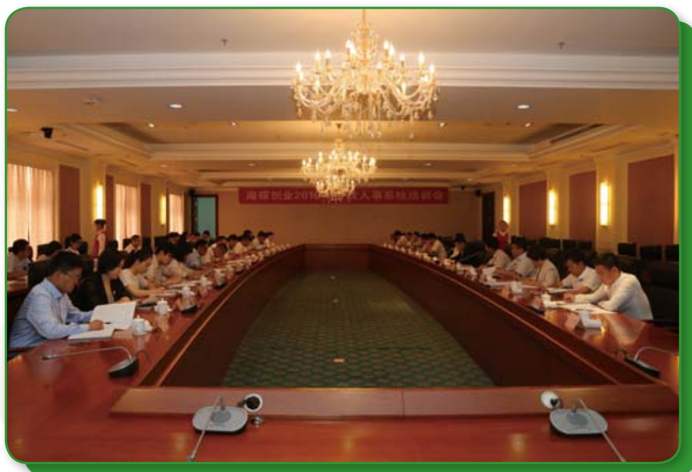
Administration and human resources training organized by the Company

The Company adopted a share option scheme so that the Group may grant options to selected participants as incentives or rewards for their contributions to the Group. Since the listing of the Group, no share option had been granted under the share option scheme.