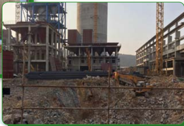
Wuhu, Huaibei solid waste treatment projects under construction